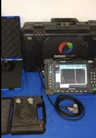
Non Destructive Testing.